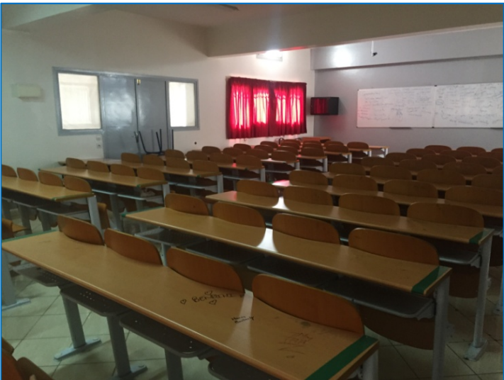
Language and course rooms and library: suitable for conferences, long workshops and courses