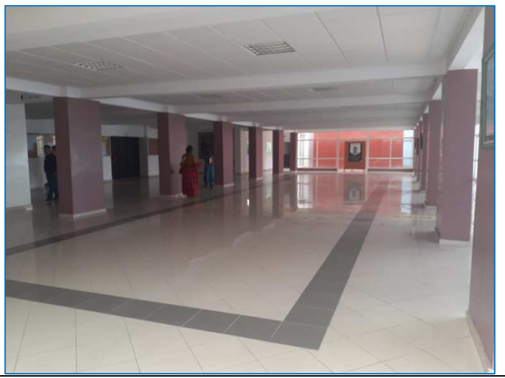
- The 2nd hall: a large space that can be used for intercultural evenings and/or exhibitions.