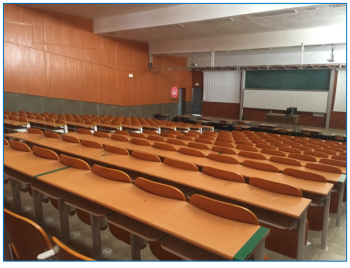
Amphitheatre 1, 2: with a capacity of 200, 250 people respectively, suitable for reception and conference areas