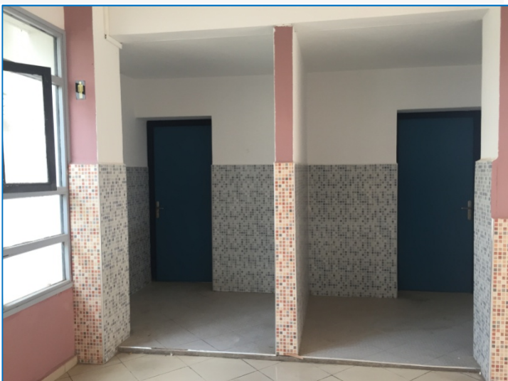
with a distribution desk, and .... next door, there are toilets