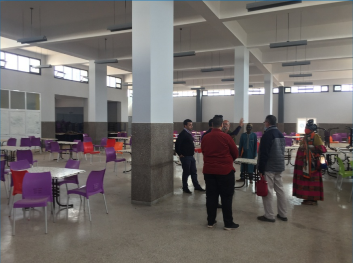
The Refectory: large, spacious, with a capacity of more than 600 people,