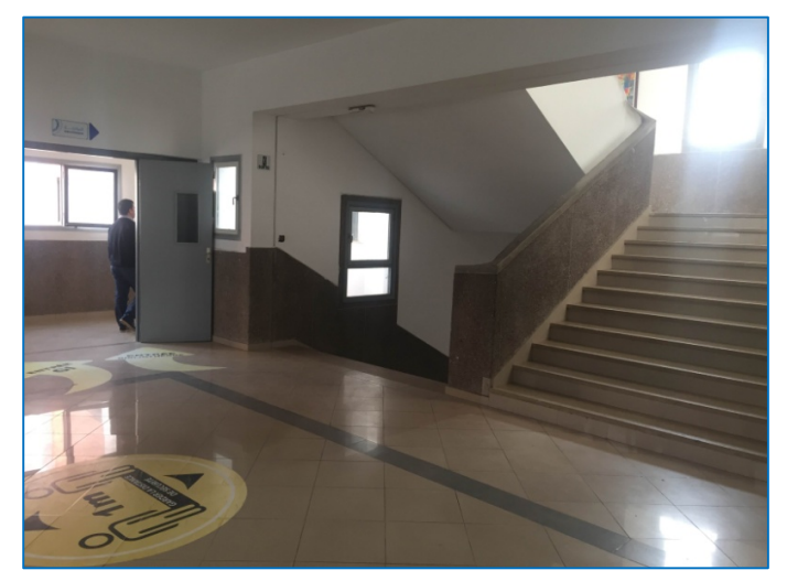
Amphitheatre 3, 4: with a capacity of 100 people each, for conferences