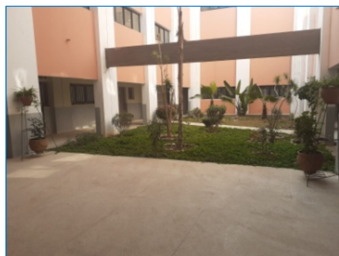
A green space that could also be used for a workshop