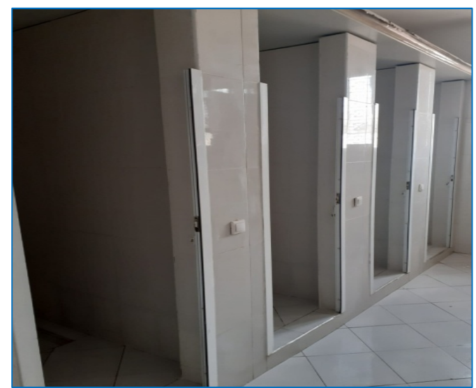
The toilets are adequate and are located in the corridor

The most important general appreciation, is that all rooms are very spacious and very bright, surrounded by nature.