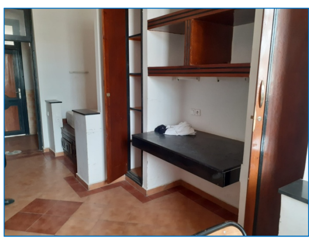
The rooms are very simple, with beds with good mattresses. There are rooms for 4 and 2 people.