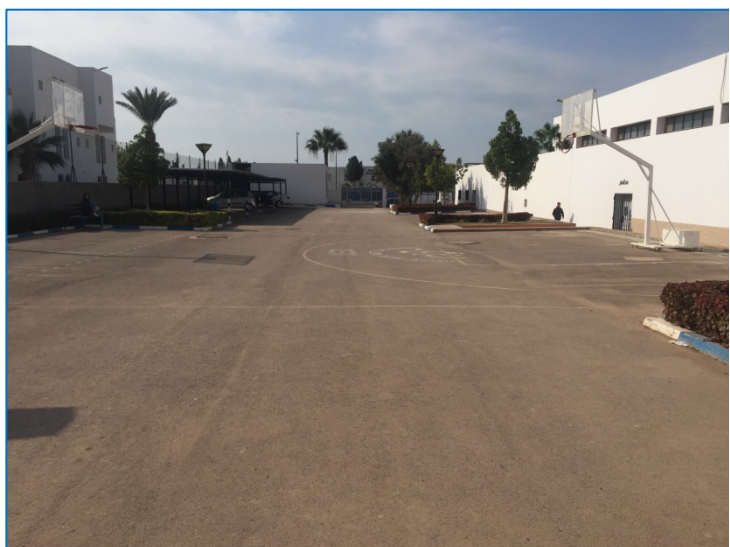
Other open spaces, a basketball court and car park