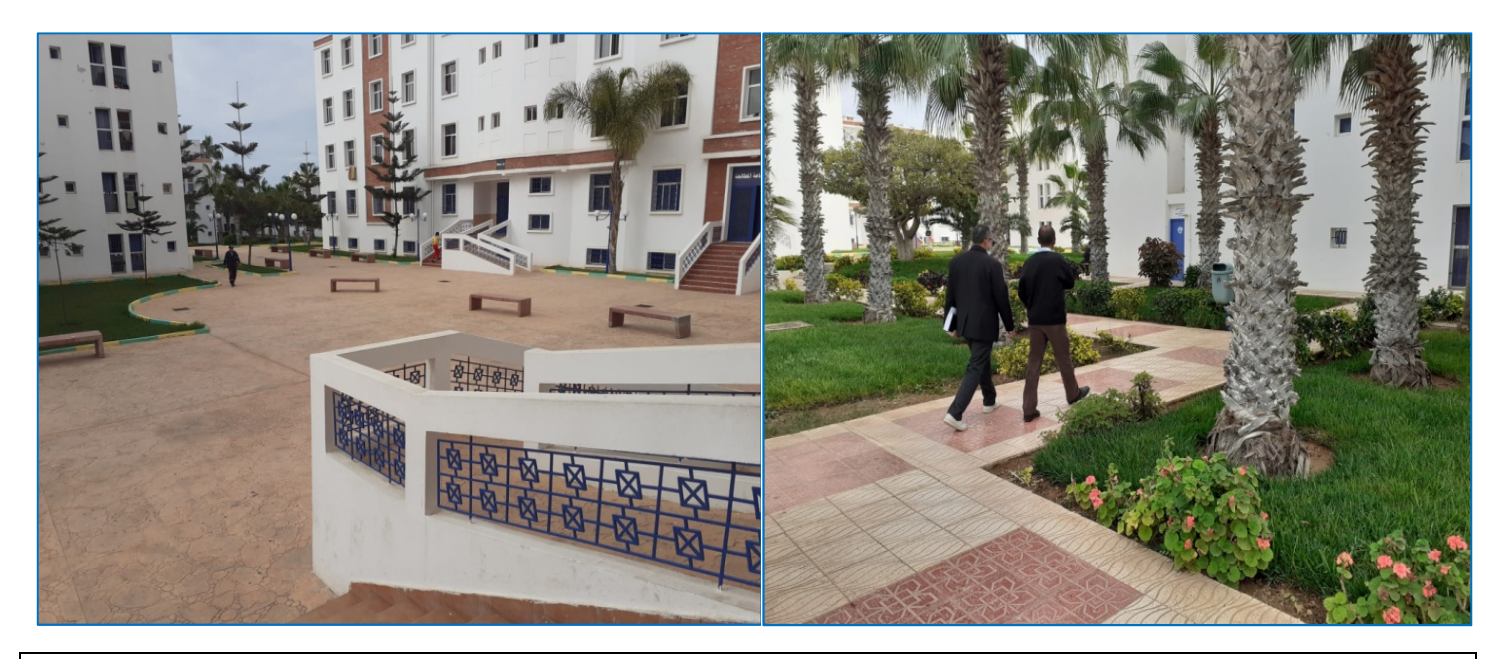
The rooms that will be used for the stay of the Ridef participants. It is a very nice place with a lot of nature and well maintained.